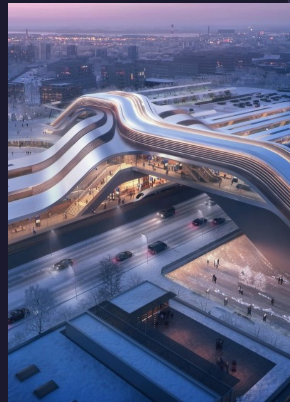
Rail Baltica Upcoming railway project