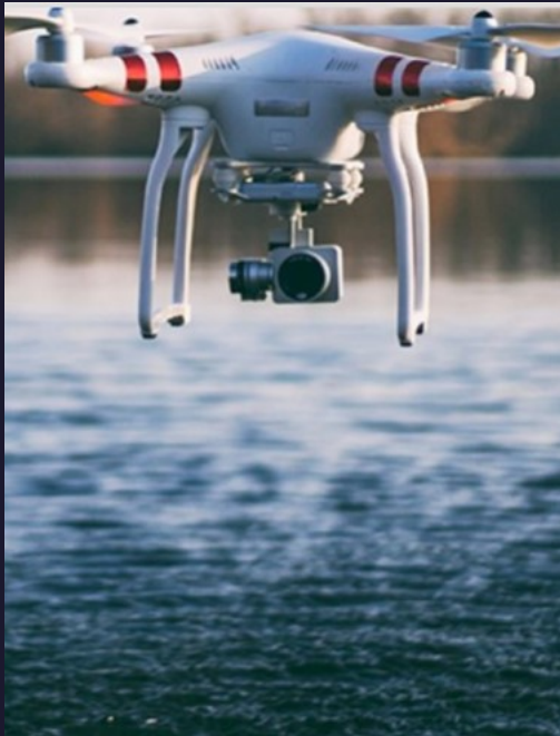
Accelerating water innovations and science industrialization