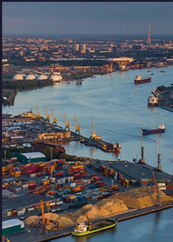
Free port of Riga Ensuring transport and transit