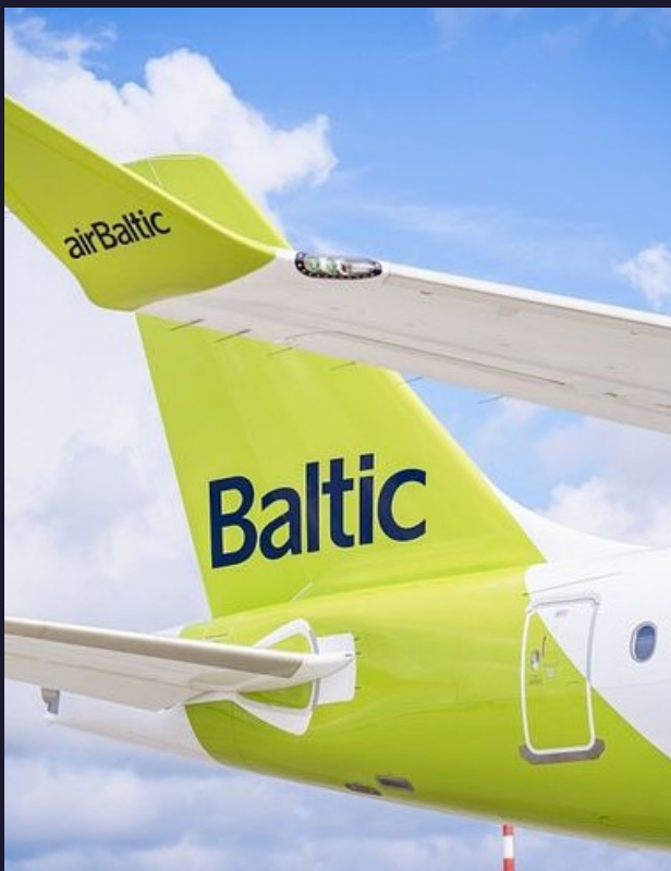
AirBaltic Securing connectivity